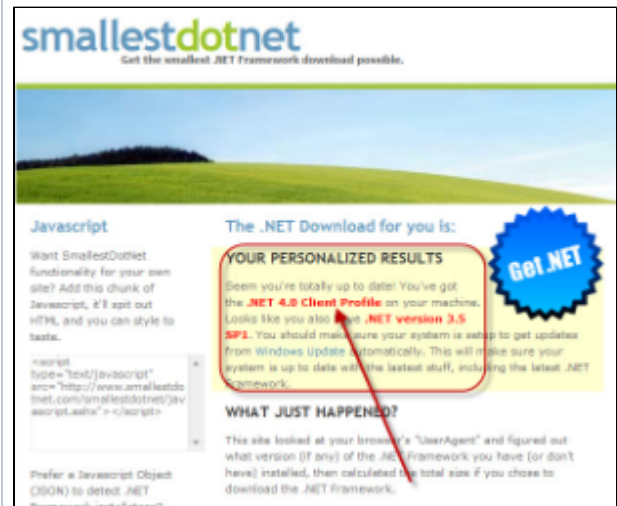
.NET version as reported by website